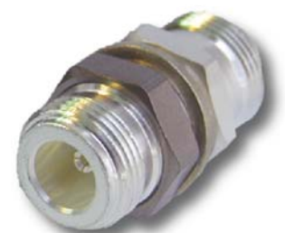
NF/50-NF/50 chassis AG

Corning Cabelcon ApS Industriparken 10 DK-4760 Vordingborg Phone +45 55 98 55 99 Fax +45 55 98 55 04 cabelcon@cabelcon.dk www.cabelcon.dk