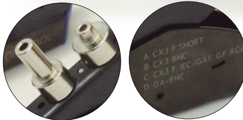
Letter ID showing relation between plunger tip and connector type