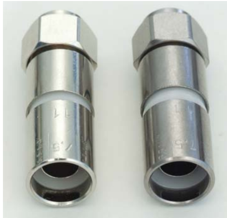
Left: Pirat Copy Right: Original Cabelcon

In addition to these exhibitions, Cabelcon's products can be found on many other exhibitions around the world - represented by our local distributors and dealers.