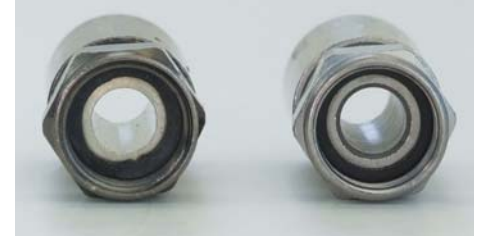
Left: Pirat Copy Right: Original Cabelcon

so far lead to new regulations for some exhibitions among others in Germany and Russia. It will be strictly forbidden to display pirate copies of others products and “pirate companies” who do not respect the rules will be abandoned from the exhibitions by legal means.