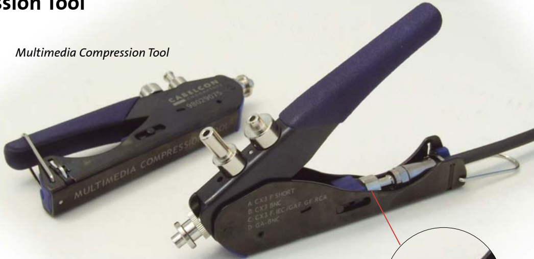
Multimedia Compression Tool

Description: Multimedia Compression Tool Item no. 98029075