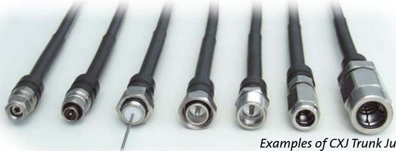
Examples of CXJ Trunk Jumpers

You can read much more about Cabelcon CXJ jumper cables in the enclosed CXJ jumper brochure – also available from our customer service department or for download from our website in PDF format.