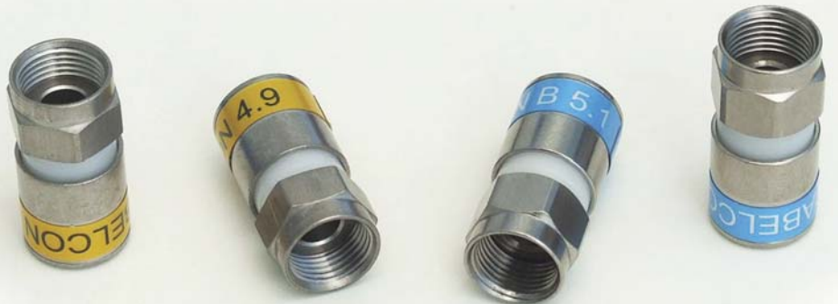
The short CX3 B & H versions

A short version of the 5.1 "B" size is also now available. The short length makes it much easier to install on hard PE-cables, while the technical performance remains unchanged.