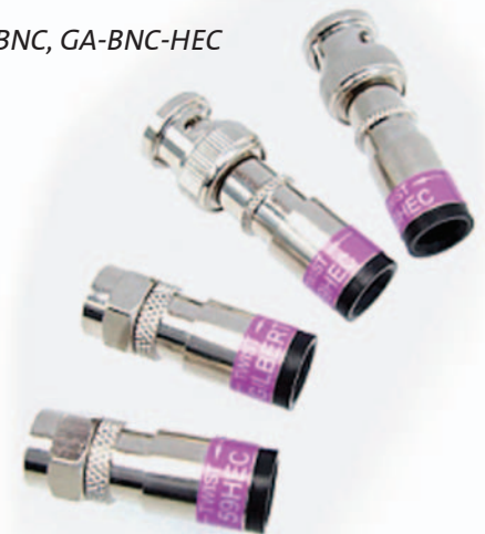
F male pin GAF-UE-59-HEC