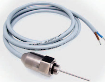
5/8M-AC power cable, item no. 91570020

Hardline cable stripper for type RG8, 11 & 213 braided cables item no. 98501105