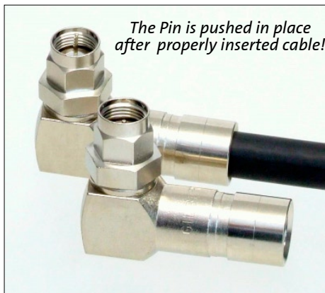
The Pin is pushed in place after properly inserted cable!

The new UltraRange® GAF-UR-11 RA comes with Cabelcon's unique Nitin-6™ plating.