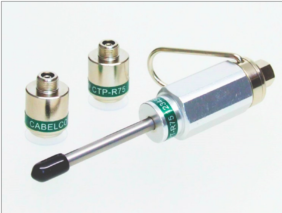
CTP-R75 Enhanced Locking Terminator with the tool