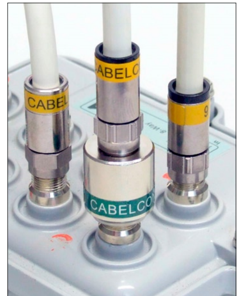
CTP-R75 Locking Terminator with a "blind connection" (only thread) for the unused subscriber cable.