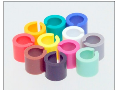
Cabelcon Colour Markers in 11 colours