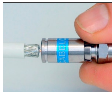
Easy "two-finger" slide on, even on hard and cold PE cables!

Trials are currently in process with several major European operators who are seduced by the easy mounting of the CX3 7.0 Try them and be convinced.