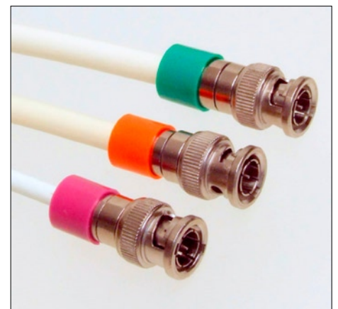
Colour Markers installed on CX3™ BNC's

Meet us and checkout the new products at ANGA Cable 2011 - stand no. K31