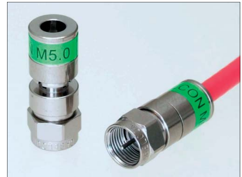
CX3 FM for mini cable 5.0