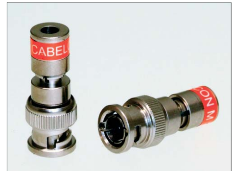
CX3 BNC male for mini cable 4.0