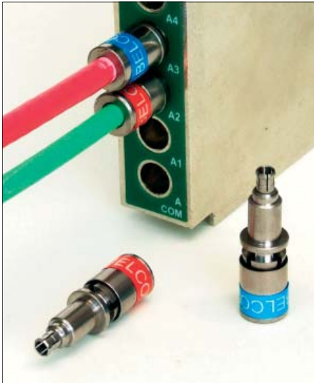
New CX3 MCX connectors for mini cables

Cabelcon MCX is equipped with our patented PushPin™ system.