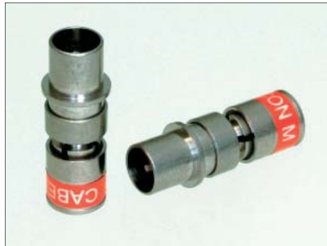
CX3 IEC male for mini cable 4.0