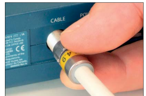
Automatic compression during installation - compression tool is not needed!