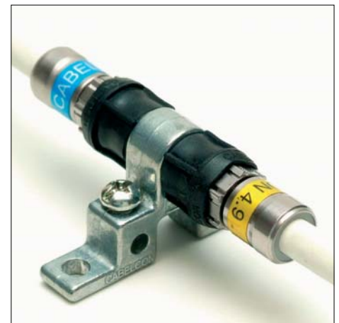
Seal rings installed on Self-Install™

The Waterproof Self-Installs are marked with a "W" after the size marking (4.9 W and 5.1 W).