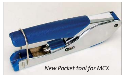
New Pocket tool for MCX

In addition to these exhibitions, Cabelcon's products can be found on many other exhibitions around the world - represented by our local distributors and dealers.