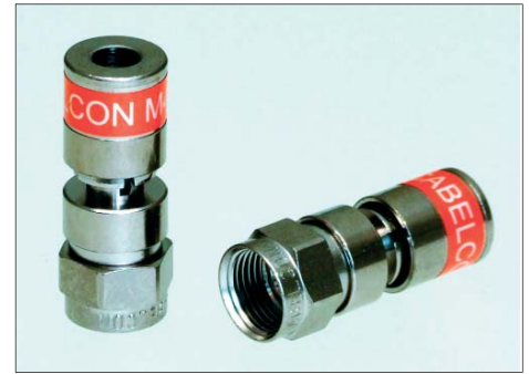
CX3 FM for mini cable 4.0

The size marking of the mini's (3.1, 4.0, 4.5 and 5.0) relates to the sizes of the cable jackets to make it easier to determine the right size for your cable.