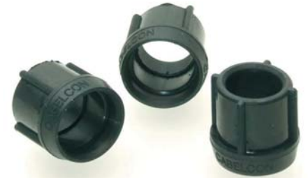
Seal Ring for F-connectors 99900902

Cabelcon has recently released a new EPDM seal-ring for F-connectors - intended to be used for our ranges of UltraEase™ and Self-Install™ connectors, where complete waterproof installations have to be ensured.