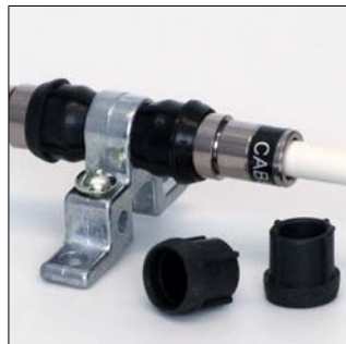
CX3 SpringConnect™ is waterproof with our additional Seal Ring Item no. 99900902