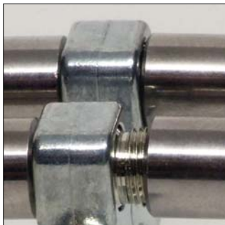
The new CX3 SpringConnect™ remains RF tight until it's completely disconnected.