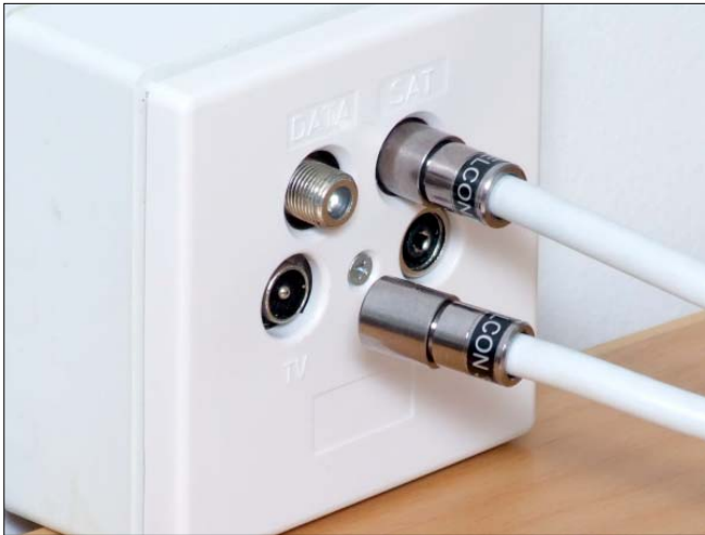
SpringConnect™ for safe use on all F-ports

Cabelcon presents the new CX3 SpringConnect™ F-connector with excellent mechanical and electrical specifications. Most ordinary push-on connectors have weak pull-off strength and poor screening capabilities resulting in egress/ingress problems.