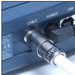
Reliable and secure modem connections. Easy to push on. Superb screening efficiency.